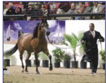
Vargas JCA - Reserve Champion Gelding